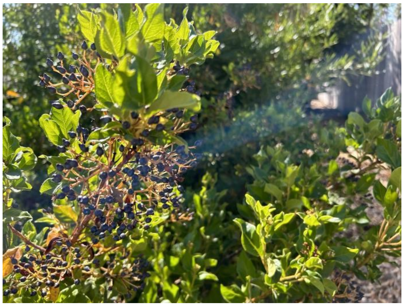
A native Coffeeberry at Linda's place. Photo & haiku by Nancy Howe

Birds nibble your fruit dancing through sun warmed branches catalysts of joy