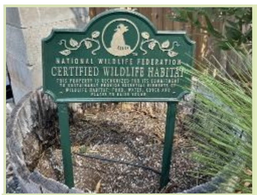
Linda's wildlife habitat on pg 4

If we grow native plants, native insects will return to feed on these plants. If native insects return, native birds will return to feed on these insects. Native plants take very little water and thrive despite harsh weather. Gardeners, this is something we can do. Let's respect and promote the native, natural Paradise.