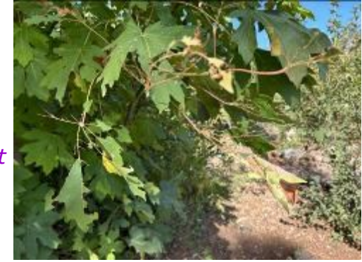
Munched on Vine Maple.